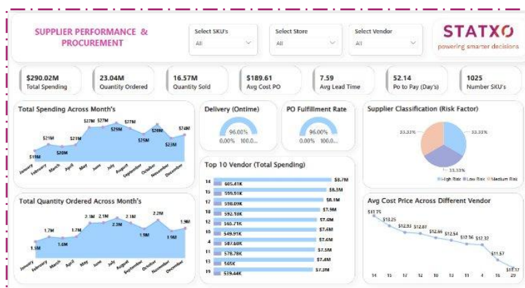
Centralized Supplier Performance Dashboard For Accurate Demand Forecasting